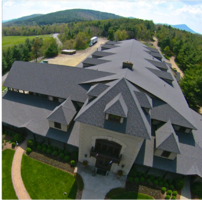
OUR VIRGINIA WINERY

10500 World Trade Blvd • Raleigh, NC • 919.481.2738 • longbeverage.com